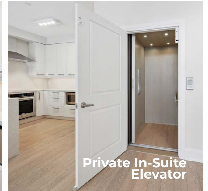
Private In-Suite Elevator