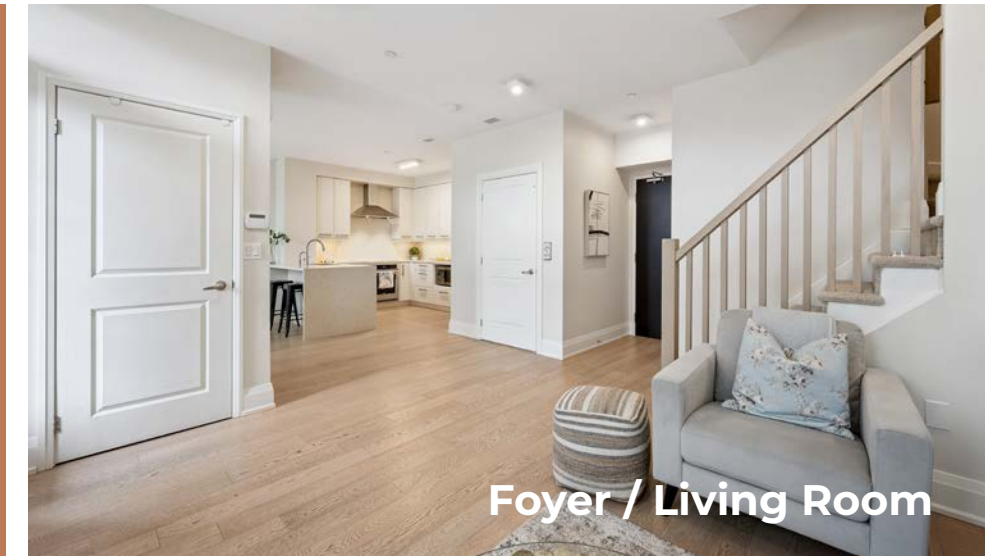
Foyer / Living Room

OFFERING PRICE: $949,999 PROPERTY TAXES: $6,499.90 (2025) SQ FT: 1,669 CONDO FEE: $1,639.85 / Monthly 3 BEDS, 3 BATHS