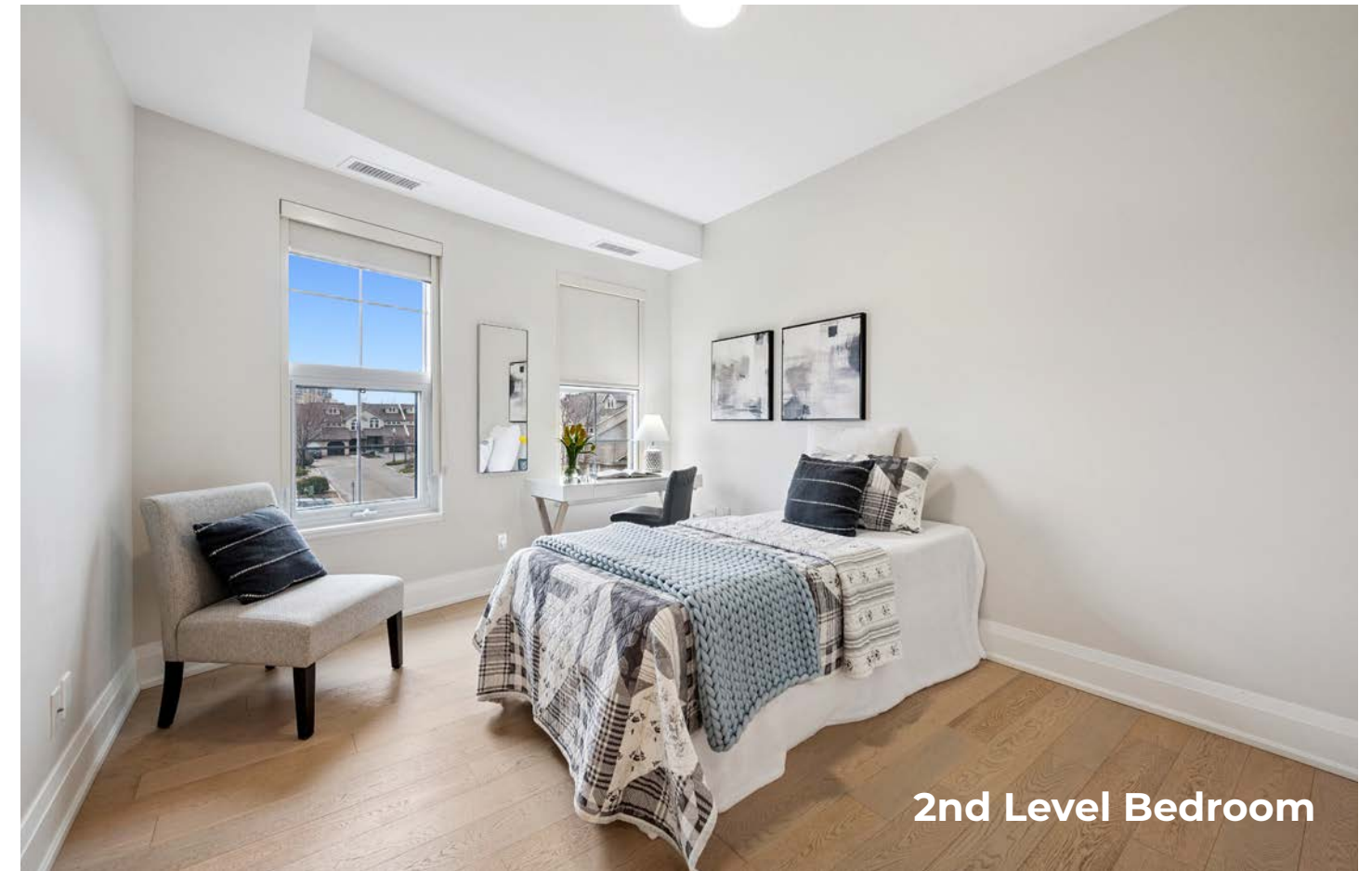
2nd Level Bedroom