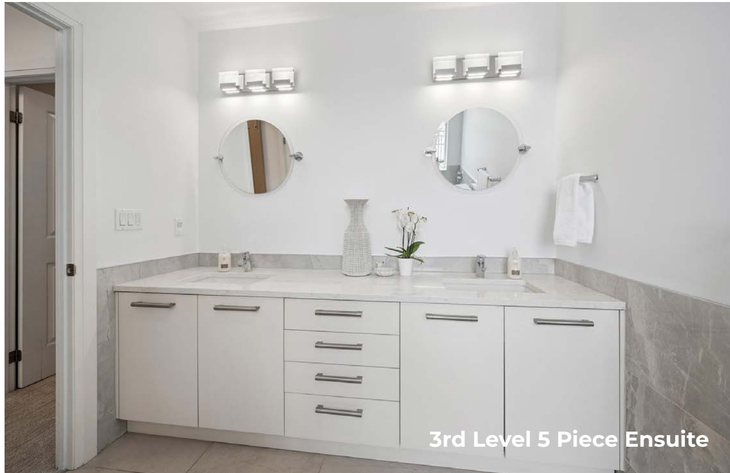
3rd Level 5 Piece Ensuite