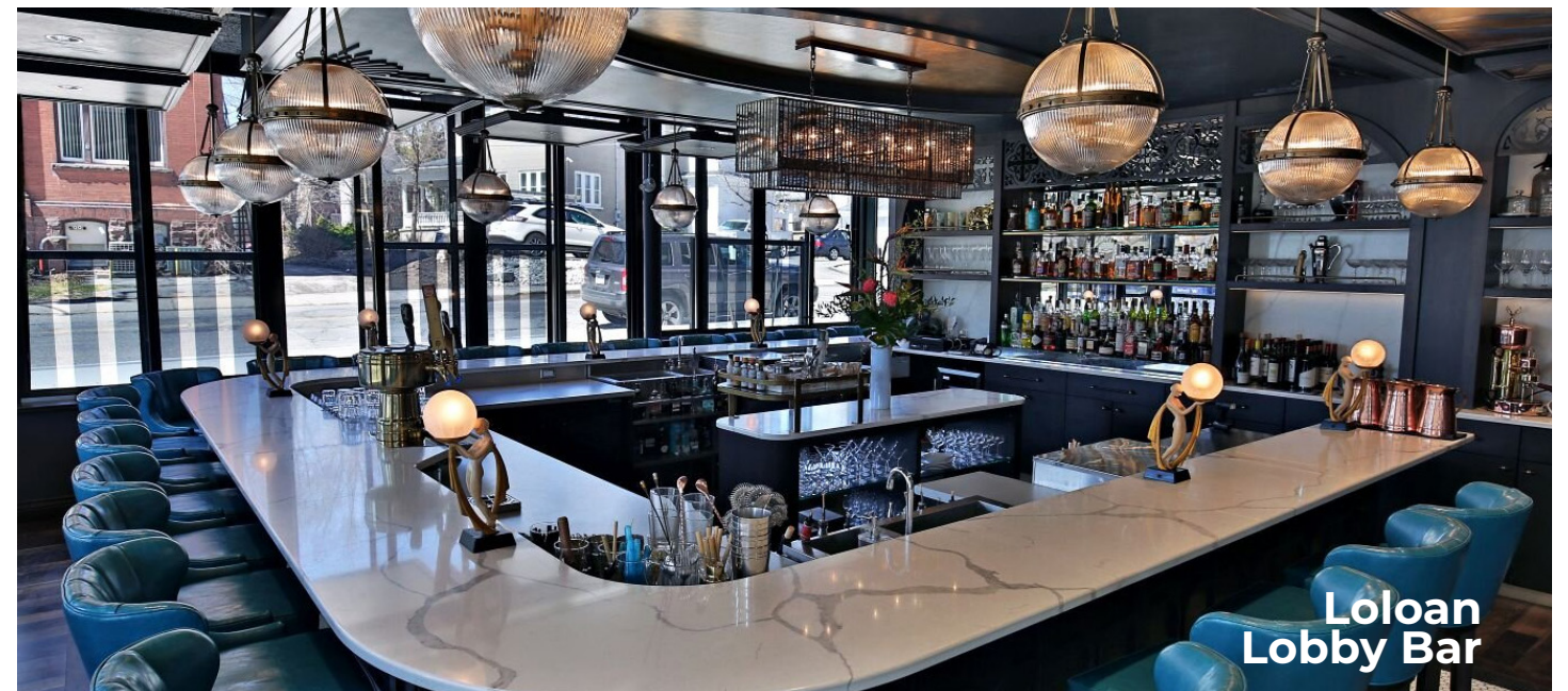
Loloan Lobby Bar