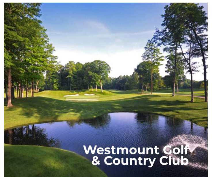
Westmount Golf & Country Club