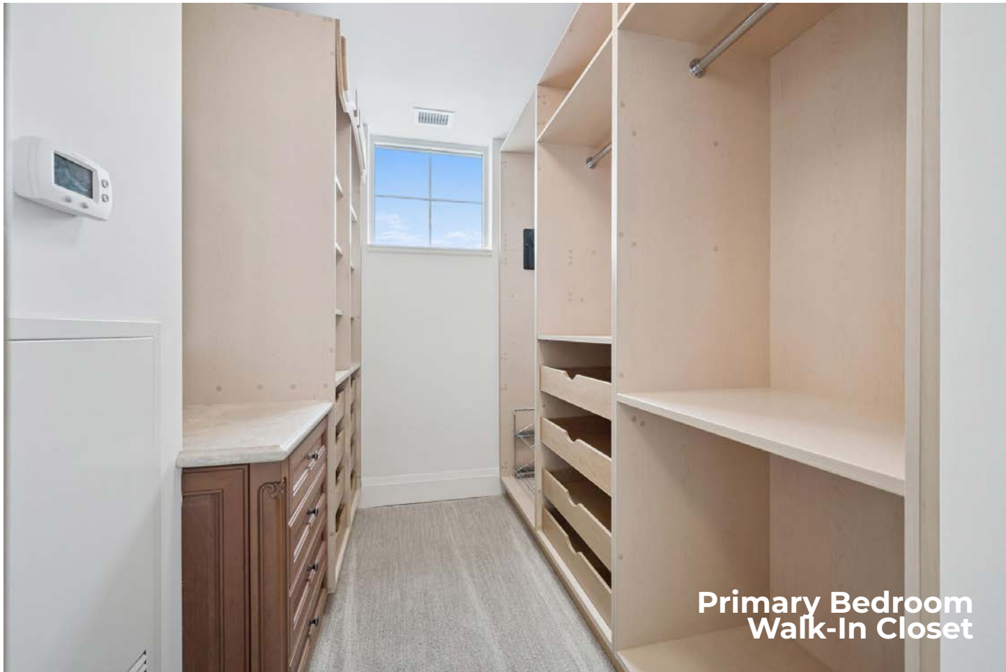
Primary Bedroom Walk-In Closet