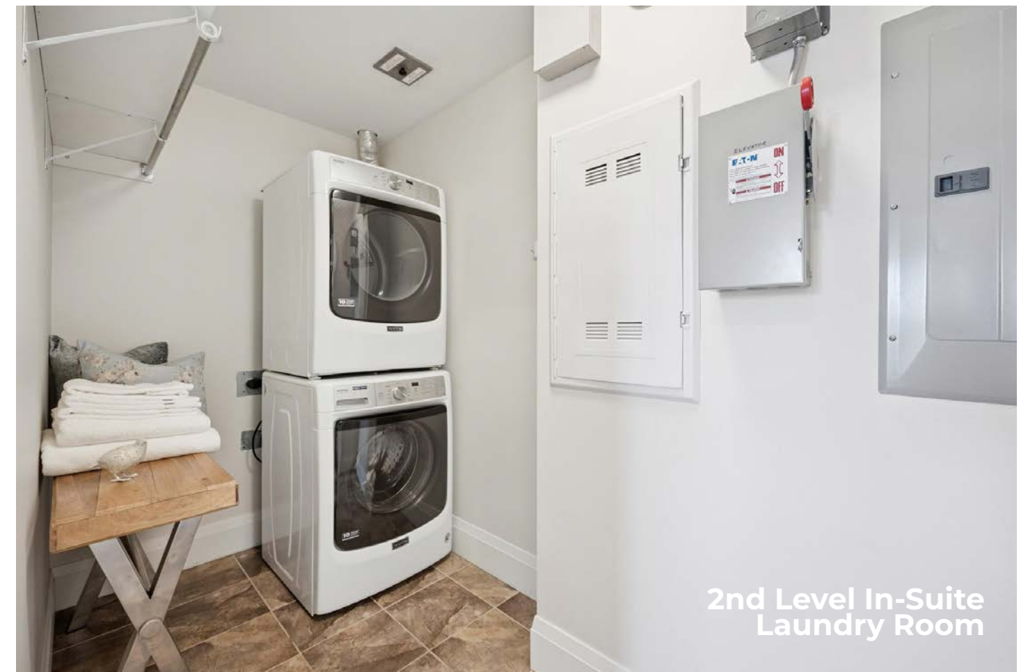
2nd Level In-Suite Laundry Room