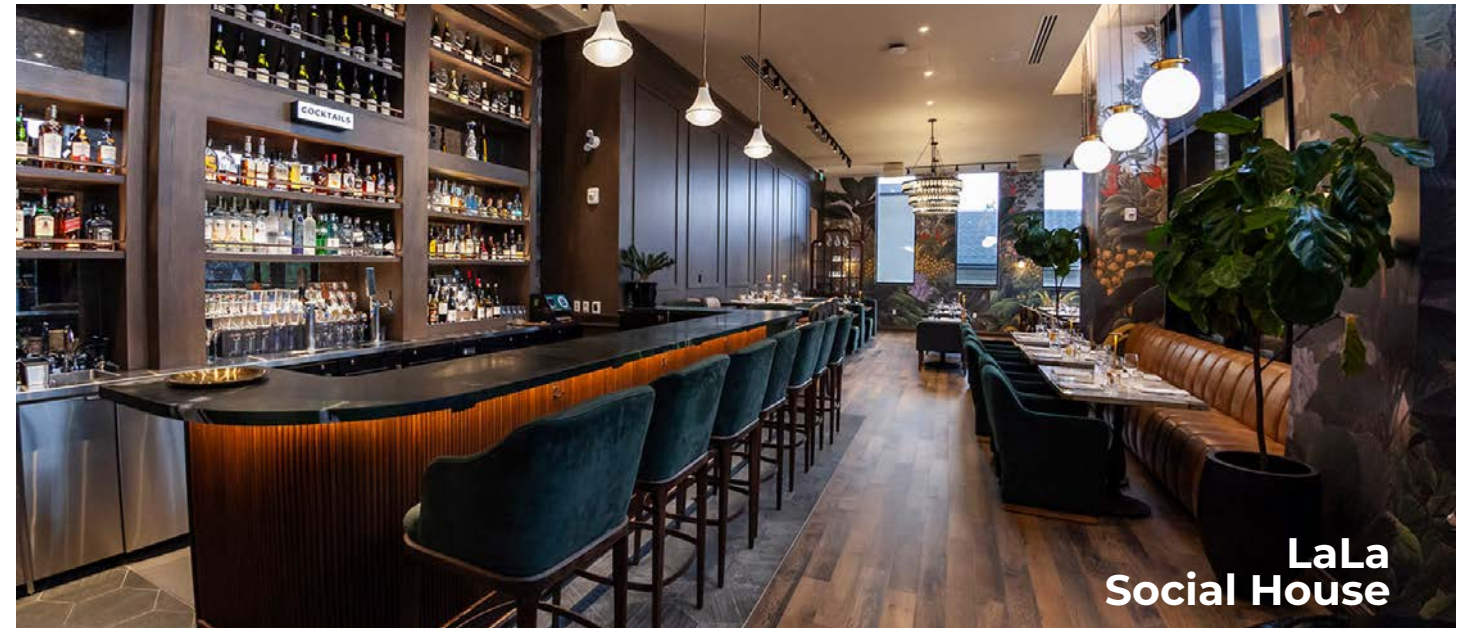
LaLa Social House