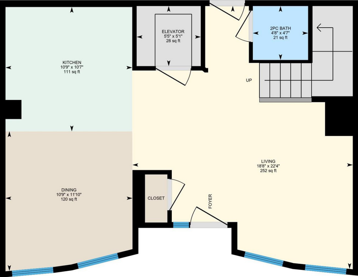
144 Park Street - Main Floor