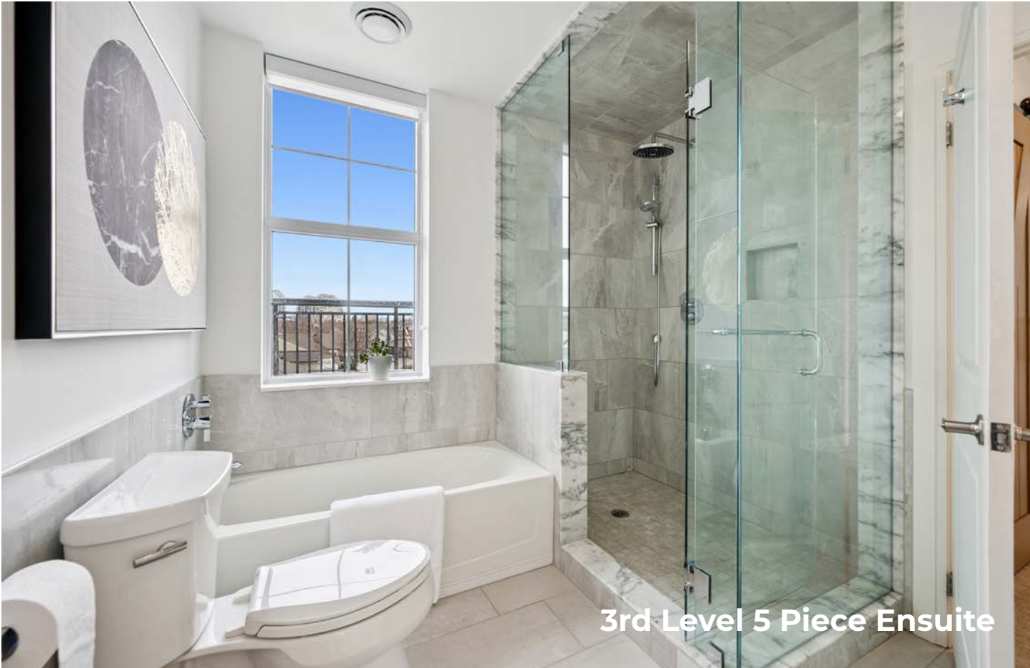
3rd Level 5 Piece Ensuite