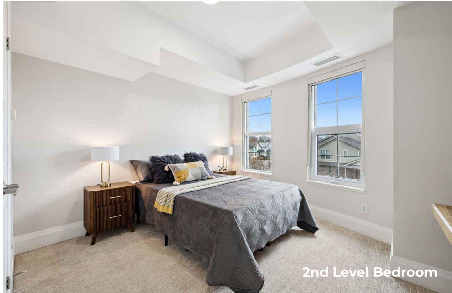
2nd Level Bedroom