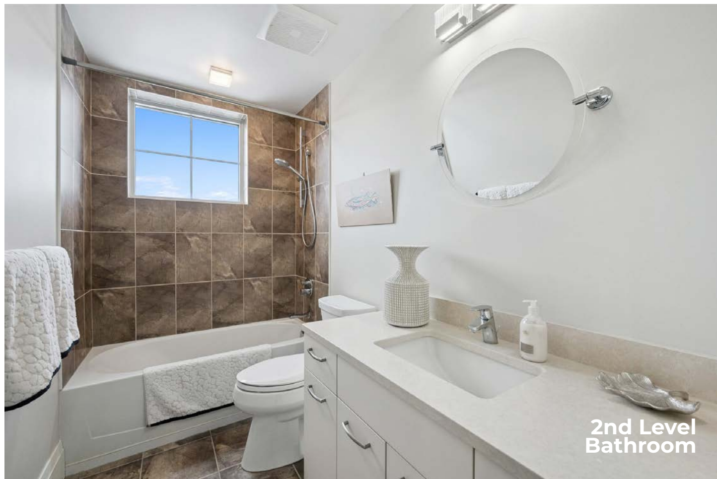
2nd Level Bathroom