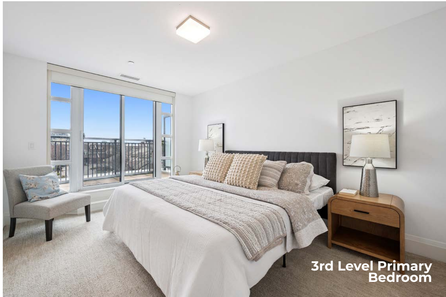
3rd Level Primary Bedroom