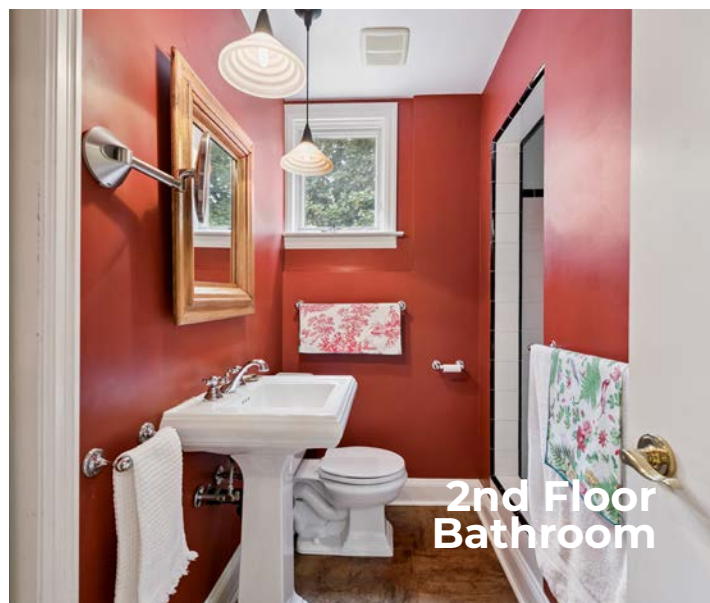
2nd Floor Bathroom