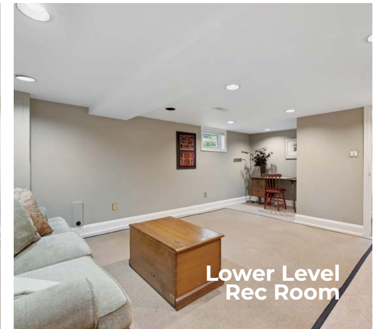
Lower Level Rec Room