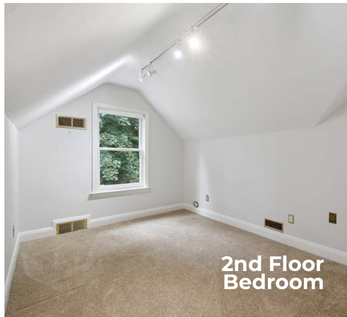
2nd Floor Bedroom