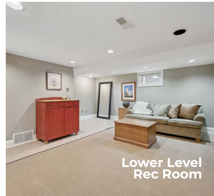
Lower Level Rec Room